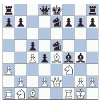
[FEN "r2qk2r/pp2nppp/8/2p1n3/2PpBbb1/ P4N2/1P1PQ1PP/RNB2RK1"]

12...f5 13.Qe1. Original and ingenious. 13...Bxf3. Had he taken the Bishop with Pawn, Stella would have obtained a fine attacking position. ( Ex gr. :- 13... fxe4 14.Nxe5 Bxe5 15.Qxe4, &c.) 14.Bxf3 Qd6. Threatening. 15.Bh5+ g6 16.Qh4 Nd3 17.Bd1 0-0 18.a4. To release the poor imprisoned Knight. 18...g5 19.Qh5 Rf6 20.Rxf4 Nxf4 and wins.